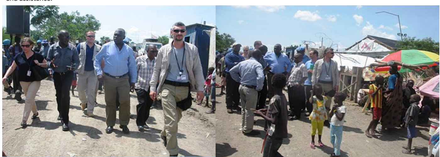
UNMISS Deputy SRSG (center) Eugene Ownsu assessing conditions at Malakal PoC site during his visit

Conflict has prevented the UN from accessing communities in areas surrounding Malakal since April, prompting a deterioration of living conditions and worsening food insecurity, which triggered thousands of civilians to make their way to the PoC site in search of protection and assistance.