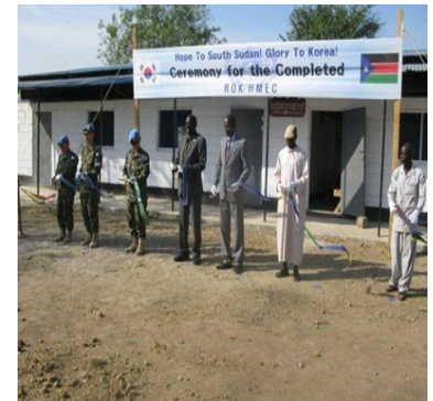
New block for Lualdit Primary School