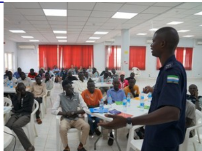
UN Police advisors conduct community training for a watch group in Juba

"We have been given knowledge and skills and we have learnt about responsibility, respect and dignity"