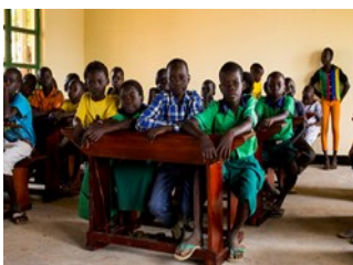
Kapuri Primary School

The UNMISS Rwandan battalion handed over newly constructed buildings to authorities in Juba County, Central Equatoria State. During a routine patrol in May 2014, Rwandan soldiers saw pupils at Kapuri Primary School, studying under trees and in makeshift classrooms with no