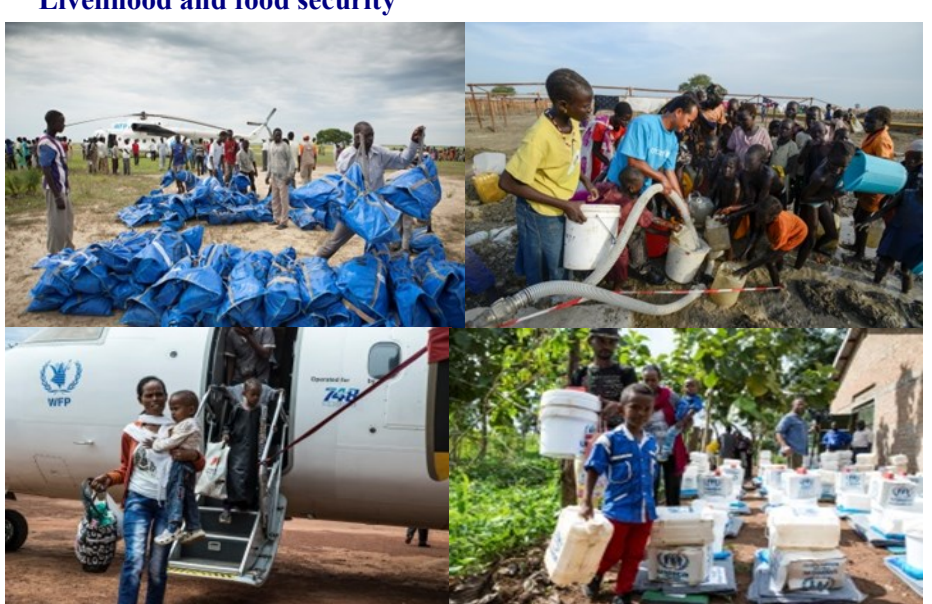
United Nations Mission in South Sudan - Communications & Public Information Office

\Diamond\Diamond\Diamond\Diamond\Diamond\Diamond\Diamond\Diamond\Diamond\Diamond\Diamond\Diamond\Diamond\Diamond